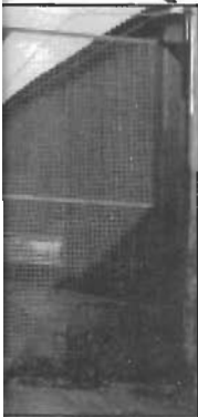
Muriel Cole ...d access road

Developers have plans for houses and flats behind the Roadworthy garage on Fishponds Road. They applied for the access to be from narrow Ernestville Rd. but this was rejected when residents objected. Then they applied to have the entrance from Dunkirk Rd. This has also been rejected on access grounds, and the Focus team have been told it will not be looked at again until March 2006.